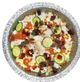
Crab Chirashi Classic

spanner crab meat, salmon roe (ikura), gold flakes, omelet (tamagoyaki), octopus, ginger (gari), cucumber, soy jelly decorated on sushi rice.