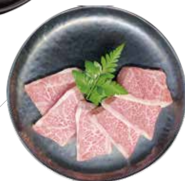
A5 Kagoshima Wagyu Rib

BBQ SAUCE or SALT & PEPPER or SPECIAL SOY SAUCE & WASABI