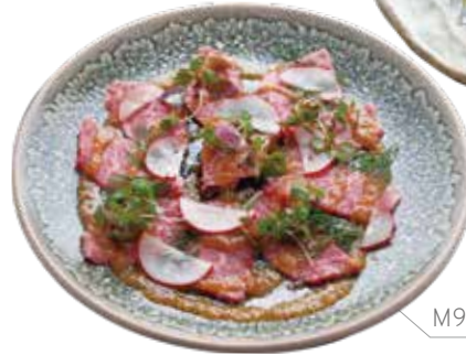
M9+ Wagyu "Carpaccio"