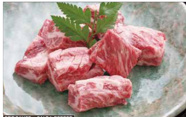
BBQ SAUCE or SALT & PEPPER

the thick part of the diaphragm muscle. tender meat.