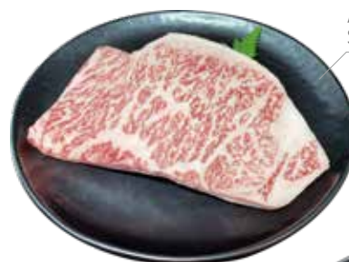
A5 Kagoshima Wagyu Sirloin Steak

be overwhelmed by the steak as well as great taste.