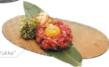
M9+ Wagyu "Yukke"