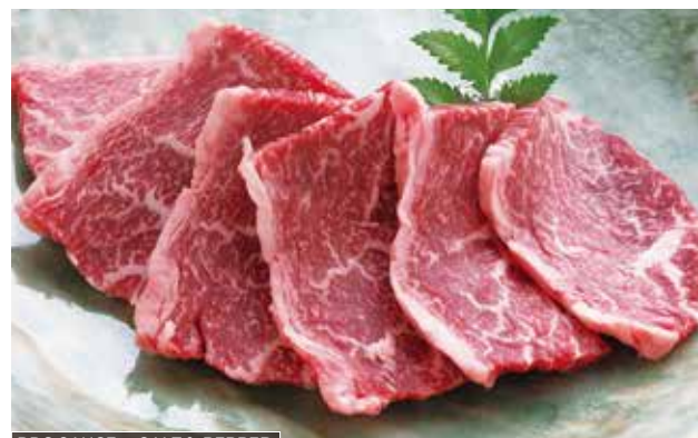
BBQ SAUCE or SALT & PEPPER

very rare meat that can be taken only from the well - grown arm. although the fiber in the centre of the meat is thick and big, this popular is very tender and juicy.