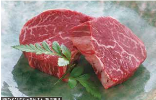
BBQ SAUCE or SALT & PEPPER