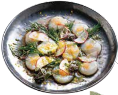
Scallop & Karasumi Carpaccio