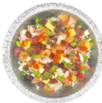
Kaisen Chirashi Classic

chopped fish sashimi, prawns, octopus, tobiko, omelet, edamame, dried seaweed, ginger (gari), soy jelly decorated on sushi rice.