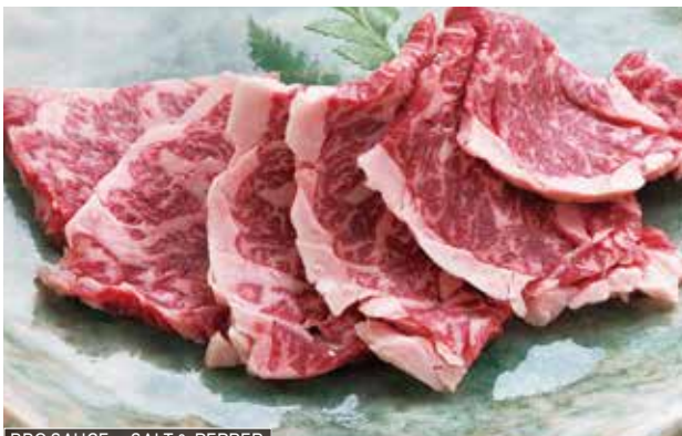
BBQ SAUCE or SALT & PEPPER

tasty meat of beef rib with moderate amount of marbled.