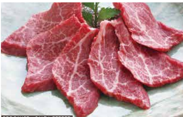
BBQ SAUCE or SALT & PEPPER

stringy part between ribs, a little chewy but taste beautiful. popular among BBQ lovers.