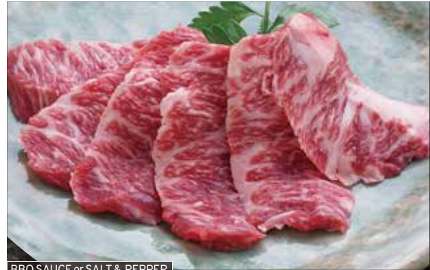
BBQ SAUCE or SALT & PEPPER

the prime tender fillet, best for those watching their waistlines.